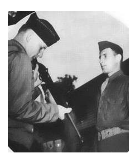
Endless inspections taught the right way, the wrong way, and the Army way.