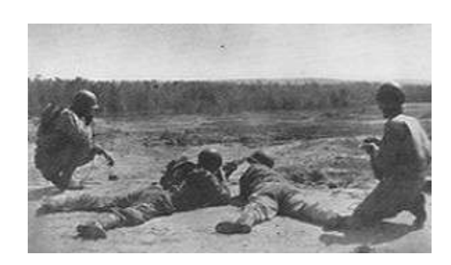
Field firing the M1 rifle, basic weapon of the American infantry in WWII.

Basic training for basic soldiers of the embryo Division was conducted by the officer and enlisted cadre throughout the winter and early spring of 1942 - 43. Military customs and courtesies were taught to orient the neophyte soldiers; close-order drill instilled discipline and cohesion; physical training toughened minds and bodies; and inspections taught "the Army way." Soon, weapons training was under way, and the men began to become familiar with the tools of the soldier's deadly craft. Long days dragged by on various Fort Jackson ranges, as the dry-fire drills gave way to live-fire practice and qualification with rifles, machineguns, pistols, and Browning Automatic Rifles. Later, grenades, mortars, and artillery live firing was added as the Division graduated from the 17-week basic training phase of the MTP into a three-month long unit training phase.