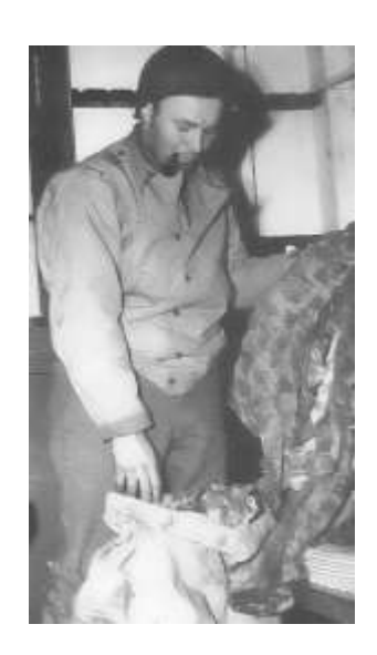
Among the many rumors that circulated about the Division's ultimate mission was one based on the temporary issue of camouflage utility unforms -- the Division was "definitely" bound for the Pacific!