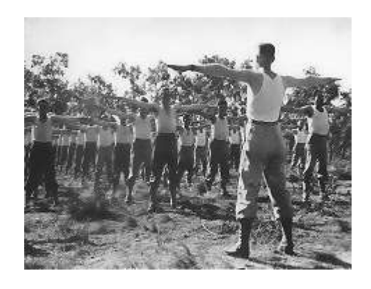
From calisthenics to conditioning marches to obstacle courses, physical training hardened the mind and the body.

In this phase, the Division sequentially built squads, platoons, companies, and battalions through a series of field problems. The intensity of training rose with the Carolina temperature, and personnel attrition took its toll. Between activation and the end of June, 1943, the Division lost over two thousand soldiers to injuries and other problems; nearly 1,000 more volunteered for and were transferred to the Air Corps, airborne divisions, or other advanced training programs; and about 500 men were selected for and left to join the Army Specialized Training Program (ASTP). The latter program, designed to use especially intelligent soldiers for the more esoteric military tasks inherent to modern warfare, would later play a large role in the Division's history.