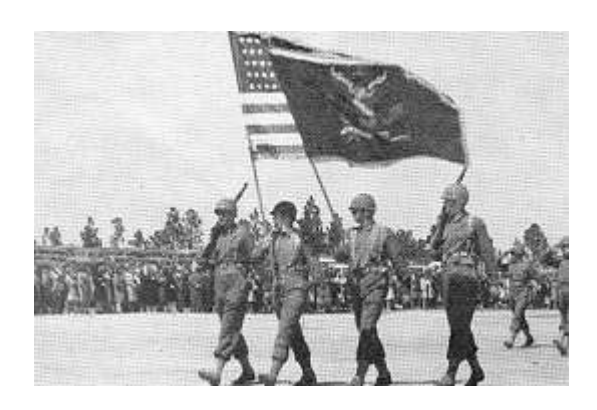
With all of the support the Division rendered to the war effort with parades, field demonstrations, and other missions, another natural rumor was that the Division would never deploy overseas. Here, the 398th Infantry passes in review.