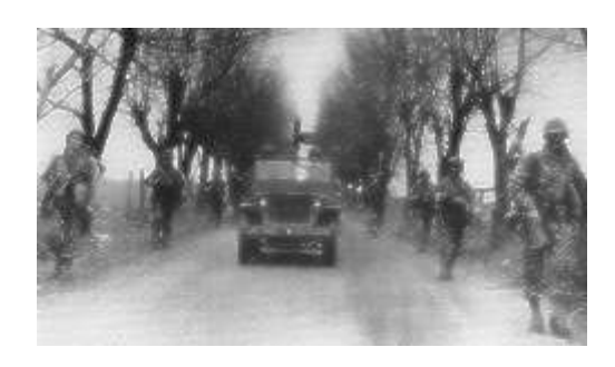
Tactical roadmarches toughened the new infantrymen physically and mentally, while bonding the new men with their "veteran" buddies.

Throughout the Division's tenure at Fort Bragg, rumors abounded regarding the Division's ultimate role in the war. The temporary issue of camouflage utility uniforms led some to believe that the Division was bound for the Pacific; ranger training made some believe the outfit was headed for Norway. Some hopeful few believed the emphasis placed on physical conditioning and drill -- actually a coherent attempt to build discipline and cohesion -- indicated that the 100th was really only a "show division." This latter rumor was reinforced by numerous visits by dignitaries such as the Secretary of War, Henry L. Stimson, and dozens of generals, senior businessmen, and the like. The participation by a select provisional battalion of the Division's smartest marchers in the Fifth War Loan Drive in New York City did little to allay this rumor of nothing but stateside soldiering in the 100th's future.