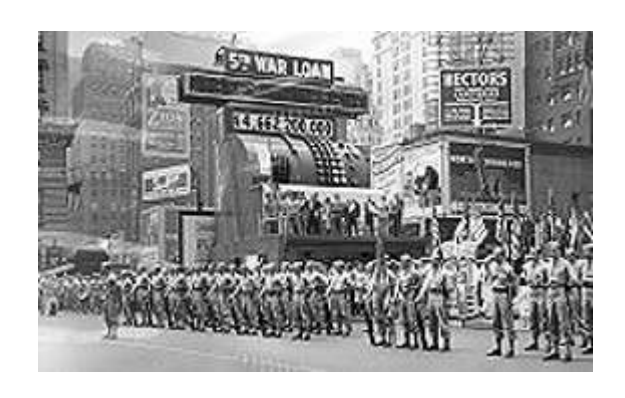
Soldiers of the Provisional Battalion at "Parade Rest" during ceremonies in Times Square on Infantry Day, 11 June 1944.