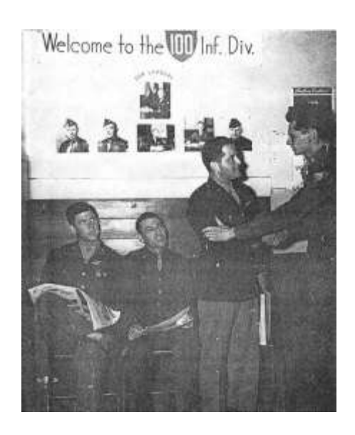
Division headquarters set up a receiving station to facilitate the inprocessing of the large number of officers and enlisted men who arrived in the spring of 1944 to replace those who were shipped out to units already in combat.

The 100th was thus "backfilled" with thousands of replacements from a variety of sources. Air crews and other personnel from the Air Corps filled the ranks, as did soldiers from antiaircraft units and service support outfits. Ironically, the largest single source of replacements for the men who shipped out to join other units already in combat was the ASTP, which was broken up in early 1944; the Army needed riflemen more than it needed Hungarian radio intercept operators or chemical engineers. That they were especially bright (the ASTP required a 115 general technical score for admission; Officer Candidate School required a 110!) was an added bonus in the bargain for all concerned. The challenges of the modern battlefield required using every possible advantage.