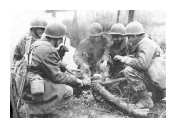
In addition to the tactical skills learned in an extended field environment, the men also came together as teams, from squads to regimental combat teams, and finally, as a Division.