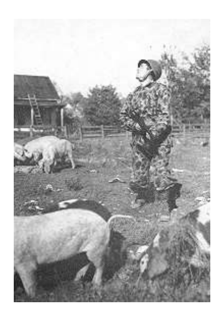
Tennessee Maneuvers placed Century soldiers in the realistic setting of not only forest and fields, but in the middle of farms and towns, as well.

The 100th left Fort Jackson for good in early November and convoyed to the 15,000-square-mile Tennessee Maneuver Area, in the Cumberland Mountains. From mid-November through mid-January, the division engaged in a series of large-scale maneuvers as part of a corps team, alternately paired with or opposing the 14th Armored Division, 35th Infantry Division, 87th Infantry Division, and 3d Cavalry Group. It is difficult to conceive of an arena in which there could have been much better preparation for what the Division would face in exactly twelve months, in other mountains, 3,000 miles to the north and east . . .