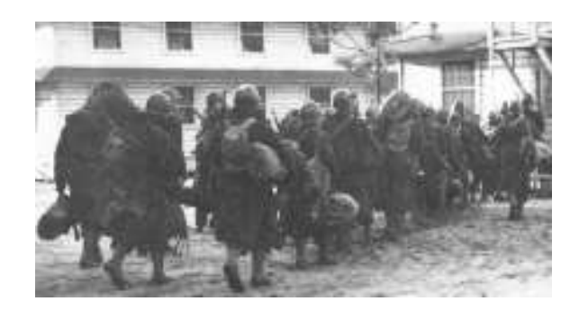
The Division arrived at Fort Bragg from Tennessee Maneuvers, cohesive and well-trained.

Unfortunately, the Division that convoyed to Fort Bragg, North Carolina in mid-January, 1944, was not the same Division that would go overseas later that year. Successive drafts of combat personnel -- overwhelmingly infantrymen -- combed over 3,500 men out of the Division in the spring of 1944, and sent them as replacements to units already in combat. The infantry replacement training centers were simply not able to keep up with the demand as Army infantry units were bloodied in Italy and the southwest Pacific. These highly-trained Centurymen bolstered the blows of the Fifth Army as it slugged its way up the Italian boot, and the Sixth Army, as it fought its way up the coast of New Guinea in the first half of 1944.