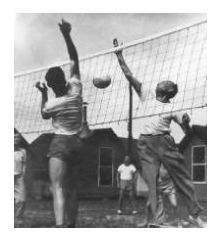
Mass athletics and intramural competition also helped develop cohesion, while conditioning the soldiers and providing a diversion from the stresses of intensive training.