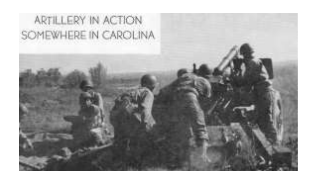
Crew from Battery B/375th Field Artillery Battalion firing during training, October, 1943.

By late October, the Division was back at Fort Jackson, ready to take on its greatest challenge to that point -- Tennessee Maneuvers.