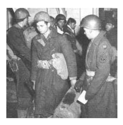
Unfortunately, not long after the Division arrived at Bragg, levies of trained soldiers were "stripped out" as replacements for units already in combat.