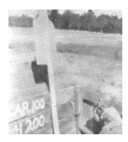
Duty in the range pits was boring, uncomfortable, and absolutely essential to the development of marksmanship skills.