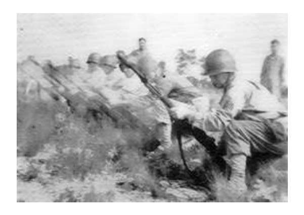
Training for the new arrivals from other branches emphasized the development of infantry skills. Here, new infantrymen learn how to employ rifle grenades.