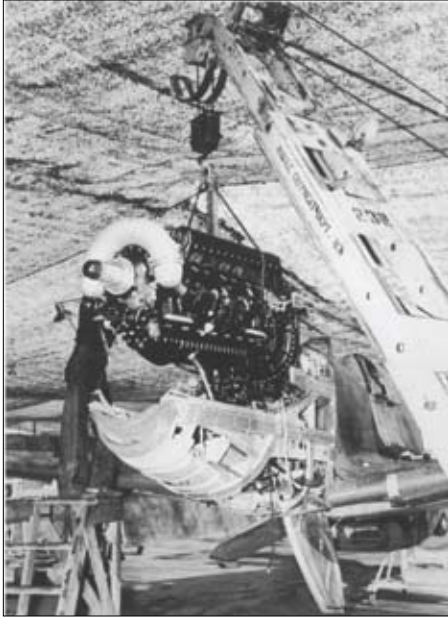
2. The Merlin Engine marries the Mustang P-51 Chassis. There are many photos of this "marriage," including those in Rolls-Royce's own historical series. This is a later one, showing a Packard-Merlin being lowered in, under a camouflage net, from Paul A. Ludwig's authoritative P-51: Development of the Long-Range Escort Fighter.

altitude of 44,000 feet, never stall, turn on a penny, and manoeuvrable at any height, plus , the greatest boon of all, a low drag and fuel economy that could take it further into Europe than any other Allied fighter. With the newly introduced drop fuel-tanks, a parallel improvement, it could accompany the B-17s to Prague and back; actually, by late 1944 Mustangs could accompany Allied bombers from East Anglia to airfields in western Russia.