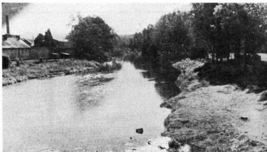
River at Baccarat

when it, too, moved north to relieve the 3d Battalion, 399th Infantry, in the vicinity of Baccarat.