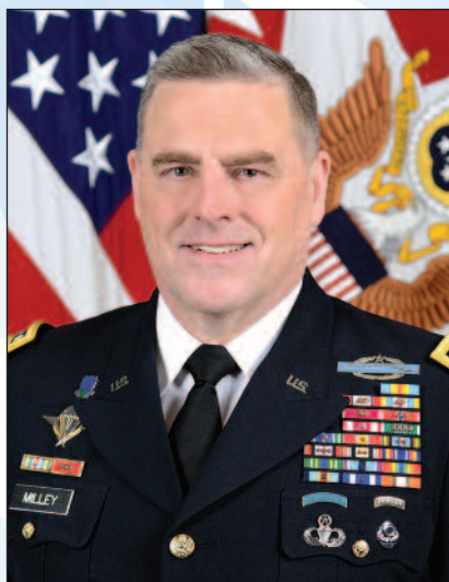
GENERAL MARK A. MILLEY, USA 39th Chief of Staff of the United States Army

General Mark Milley is being recognized for his distinguished career in the U.S. Army, his many contributions to U.S. defense and his leadership of the U.S. Army at the highest level. General Milley assumed duty as the 39th Chief of Staff in August 2015 after most recently serving as the commander of U.S. Army Forces Command at Fort Bragg, North Carolina. A native of Winchester, Massachusetts, he graduated and received his commission from Princeton University in 1980. He has had multiple command and staff positions in eight divisions and special forces throughout the last 35 years. He has served in command and leadership positions from the platoon and operational detachment alpha level through Corps and Army Command including the 82nd Airborne Division and the 5th Special Forces Group, the 7th Infantry Division, the 10th Mountain Division, the 2nd Infantry Division in Korea, the Joint Readiness Center, the 25th Infantry Division, the 101st Airborne (Air Assault) and the 1st Cavalry Division and 3rd Infantry Division in Baghdad, Iraq. While serving as the commanding general, III Corps and Fort Hood, he deployed as the commanding general, International Security Assistance Force Joint Command and deputy commanding general, U.S. Forces–Afghanistan. Additionally, he served on the operations staff of The Joint Staff and as a military assistant to the Secretary of Defense.