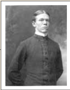
Cadet George C. Marshall at VMI, as First Captain in early 1900.