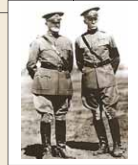
Gen. John J. Pershing and Col. Marshall in France, 1919. Marshall served as a planning officer for Gen. Pershing and later became his aide-de-camp. After the war, he was reverted back to a peacetime rank of major.