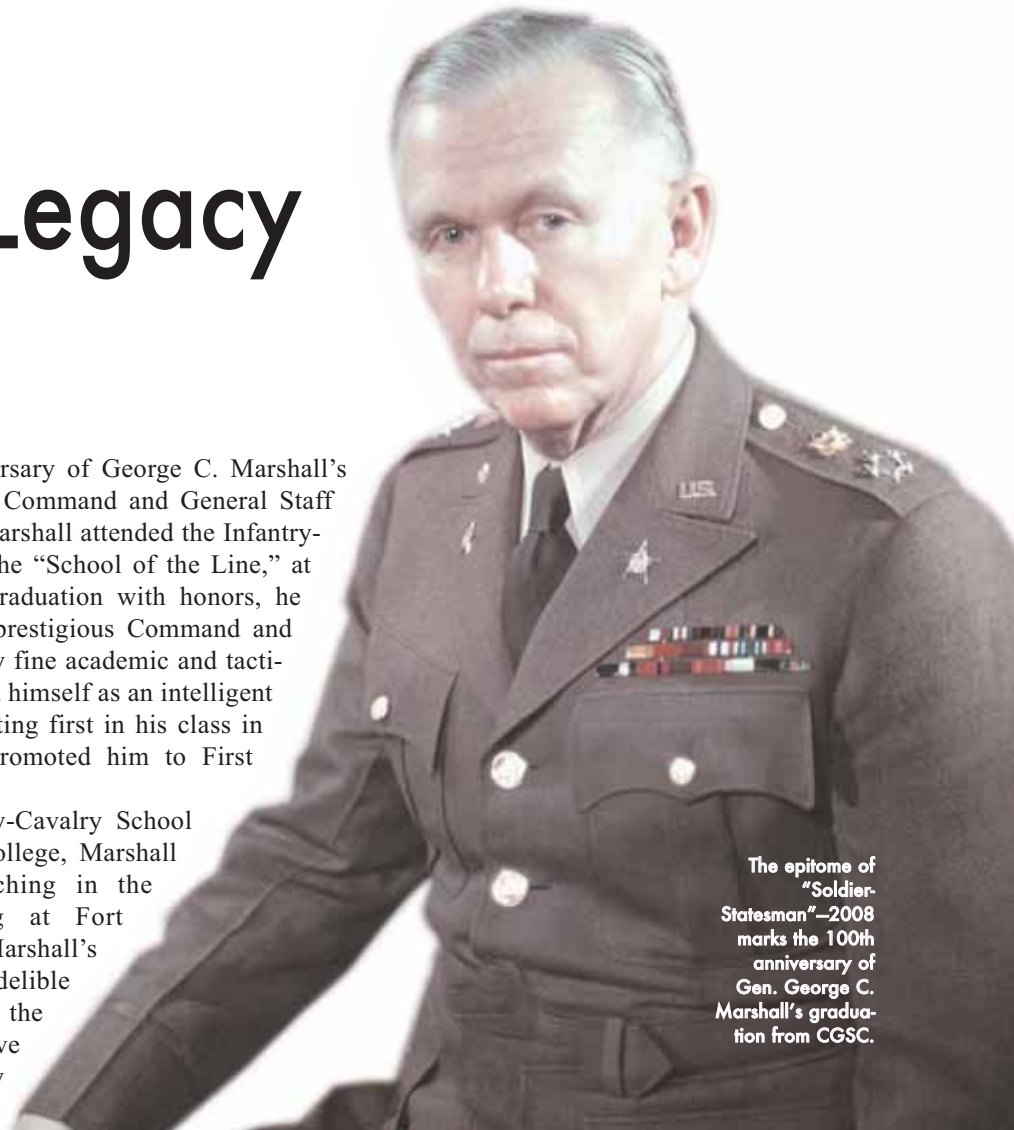
The epitome of "Soldier-Statesman"—2008 marks the 100th anniversary of Gen. George C. Marshall's graduation from CGSC.

Beyond his attendance at the Infantry-Cavalry School and the Command and General Staff College, Marshall also spent two additional years teaching in the Department of Military Engineering at Fort Leavenworth between 1909 and 1911. Marshall's years at Fort Leavenworth made an indelible impression upon the young officer. In the future, he would eventually go on to serve as the Chief of Staff of the Army