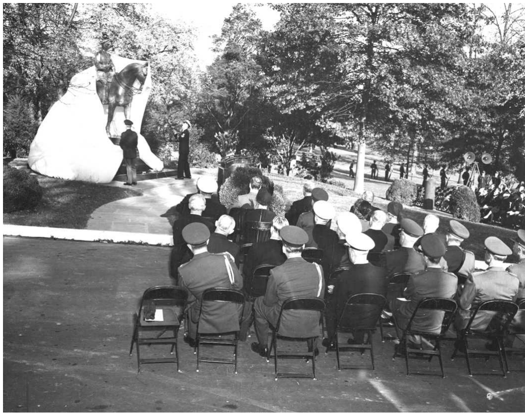
Caption: Unveiling the Dill statue at Arlington National Cemetery, November 1, 1950. The memorial is near the Tomb of the Unknown Soldier and is one of only a few statues in the cemetery.

Dill and Marshall first met at the Atlantic Conference in August 1941. There is some evidence to suggest that initially Dill, like [Field Marshall Sir Alan Brooke, later Lord] Alanbrooke, found Marshall wanting