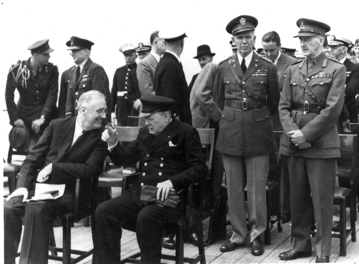
Marshall and Dill, with President Roosevelt and Prime Minister Churchill on HMS Prince of Wales in Placentia Bay, Newfoundland, August 10, 1941, following church services during the Atlantic Conference. In January 1942, Dill was named head of the British Joint Staff Mission in Washington, representing the British Chiefs of Staff, and he sat as a member of Combined Chiefs of Staff when the CCS met. It was an open secret that he represented Churchill in the latter's capacity as Minister of Defence.

strategically; [4] but indisputably, the two men discovered an immediate and "un-English" empathy, perhaps as surprising to the protagonists as it was to observers. Additionally, a clear-eyed awareness of their respective national interests may well have been stronger at this early stage, before they had any real foundation for the implicit trust that was to be the hallmark of their Washington association. [5] Be that as it may, the day after Dill's return to London, he wrote in most unusual terms to Marshall: "I sincerely hope that we shall meet again before long. In the meantime we must keep each other in touch in the frank manner upon which we agreed." A few days later, Marshall responded: "I feel greatly reassured by my conversations with you, and I propose writing to you personally and very frankly whenever any matters arise which I think merit such attention. I am depending on you to treat me with similar frankness, and I am quite sure you will do so."