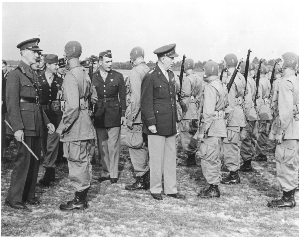
Field Marshal Dill (left) and General Marshall inspect a parachute infantry unit at Pope Field, Fort Bragg, North Carolina, May 1 or 2, 1942. Brig. Gen. William C. Lee of Airborne Command is in the center.

Dill and Marshall in tandem made the CCS system work. This was their inalienable achievement. Neither conception nor execution of a war-winning strategy could be immaculate; indeed, getting "mixed up together" promised sin of a most