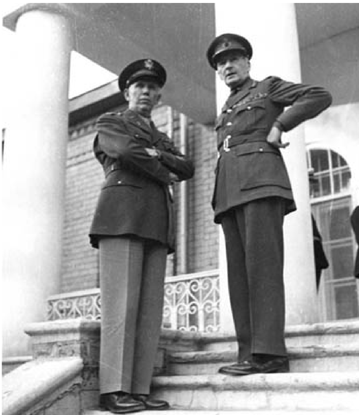
Marshall (left) and Dill on the steps of the Soviet Embassy in Teheran, Iran, November 29 or 30, 1943, during the Big Three Conference.

As his intimacy with Marshall deepened, Dill virtually came to be defined as a guarantor in official American circles, as much for what he was, or was perceived to be, as for what he did. [12] So solicitous was Marshall of this relationship that by late 1943, a double paradox was obtained. Not only did the known tension between the Minister of Defence and his representative actually enhance Dill's value in the US; it also provoked the Americans themselves to demonstrate that value to Churchill. Thus, the spate of honorary degrees awarded Dill in early 1944, with maximum attendant publicity, was inspired by Marshall as part of "a regular campaign . . . to have Dill honored in this country." American anxieties seem to have been quickened by the unusual spectacle of sharp public clashes between Dill and Churchill at the Cairo/Teheran Conferences of November-December 1943. Among other things, Churchill resented Marshall's suggestion of Dill as Supreme Commander for OVERLORD (the landings in northwest Europe). Dill spoke "very bluntly" to him, saying (in Hopkins's words) "he was free, white and 21 and was going to tell him what he thought whether he liked it or not." [13]