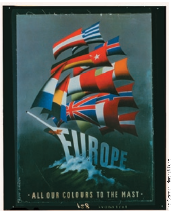
One of 25 designs selected in a 1950 competition to create posters capturing the goals and spirit of the Marshall Plan. 10,000 entries were submitted by artists from 13 Marshall Plan countries.

as free, or as liquid, as the Europeans had imagined. It would instead normally be merchandise sent from the United States and sold to the highest bidder, public or private. Their payments would then go back, not to the United States, but into the new fund. From it would come the money to pay for national reconstruction and modernization efforts, as decided between the ECA mission and the government in each participating capital.