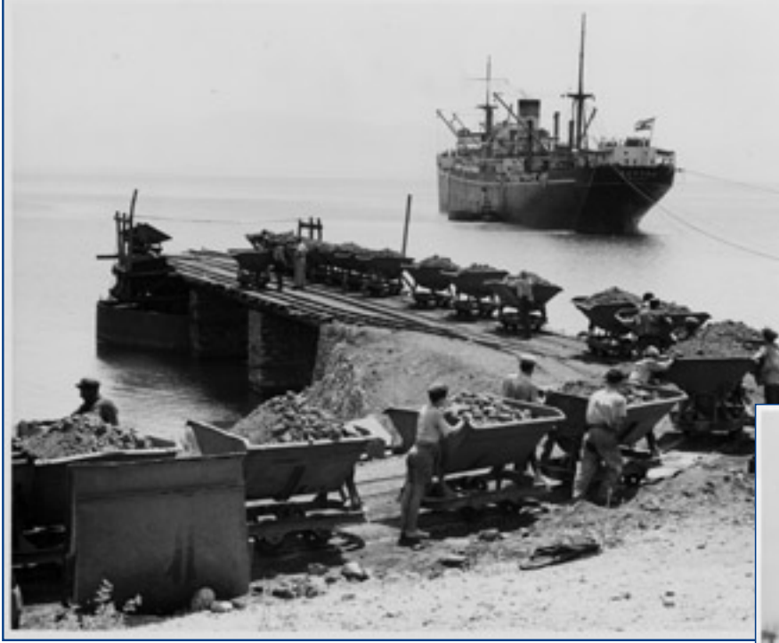
ibrary of Congress