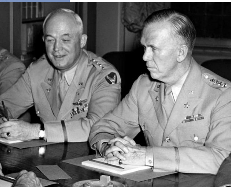
Gen. Henry "Hap" Arnold and Gen. George Marshall