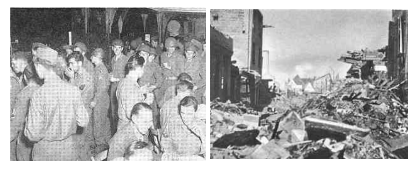
With the German economy in ruins Centurymen patronized Army recreation and dining facilities, like this one in Stuttgart.