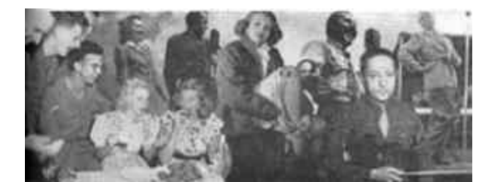
USO shows were gratifying and entertaining, and helped pass the time until Century soldiers could finally go home.

A darker side of the post-war sightseeing regiment also included trips to Dachau concentration camp for some units. Few of the Centurymen who visited the camp will ever forget the pure horror of the experience, or the perspective it afforded. It certainly helped all understand what it was they had been fighting against. . .