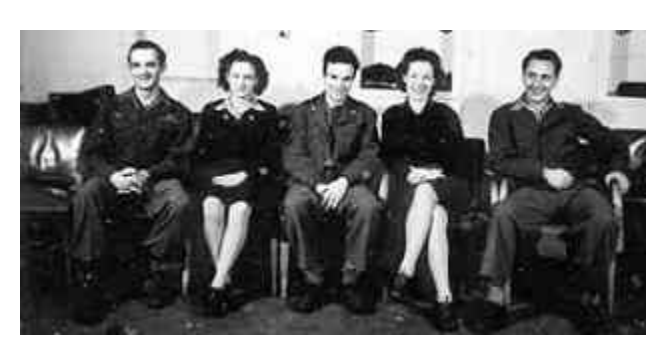
Red Cross "Doughnut Dollies" provided one alternative to the local genera femina .

Eventually, the non-fraternization rule was lifted, and that particular problem was solved. At the beginning of the second week of July, the Division was displaced to a new zone of occupation, further to the west. Still, there were 133 former enemy installations to be secured, and large cities to be patrolled, including Stuttgart (Location of Division Headquarters) and Pforzheim.