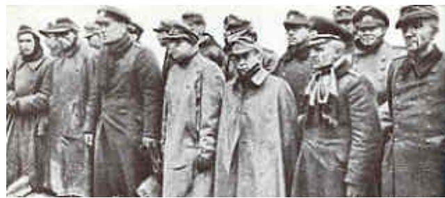
Liberated Polish DPs cheer Centurymen along a roadway near Backnang.